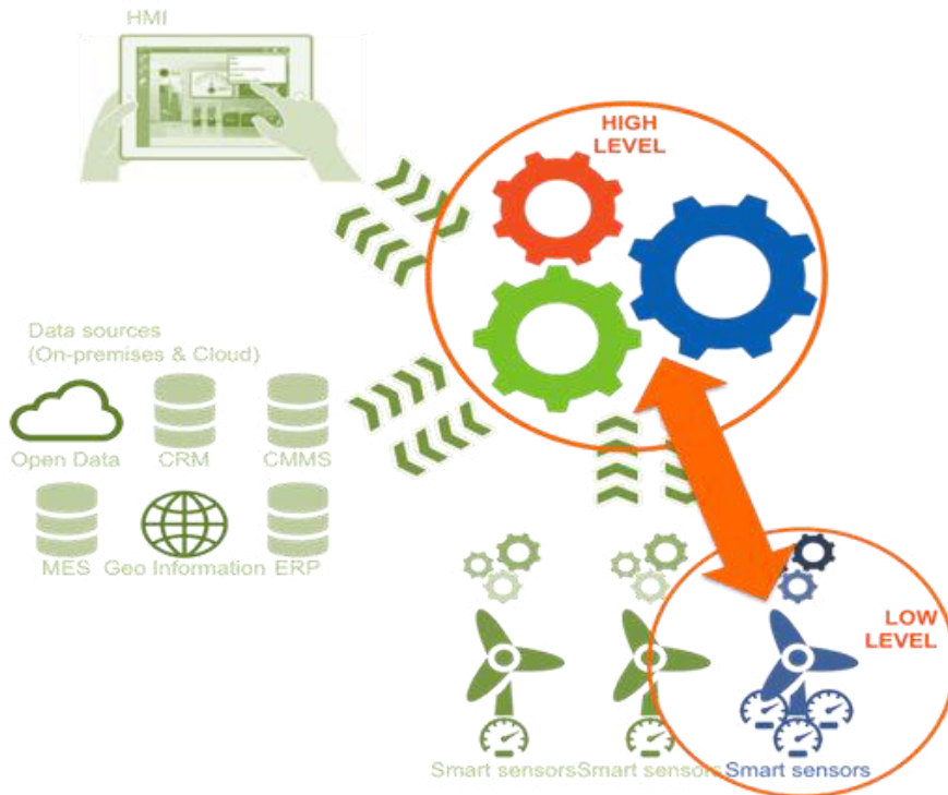
Fig. 1. MANTIS overall concept idea and data processing levels [14].

Since data sources are typically characterized by distribution, heterogeneity, and a high degree of dynamicity (e.g. data sources like sensors can be plugged and unplugged any time), the design of the MANTIS architecture has been driven by the following main requirements: