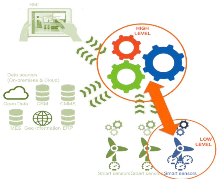
Fig. 1. MANTIS overall concept idea and data processing levels [14].

Since data sources are typically characterized by distribution, heterogeneity, and a high degree of dynamicity (e.g. data sources like sensors can be plugged and unplugged any time), the design of the MANTIS architecture has been driven by the following main requirements: